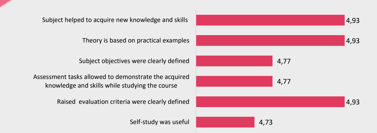
Figure 1. Evaluation of the content quality of the course units taught in the Emergency Medical Aid study programme according to the criteria (averages).

Note: "Likert" scale average is presented. The higher the average, the more respondents agree with the statements+